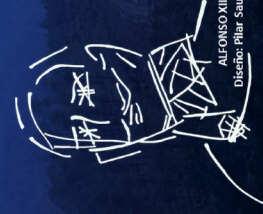
ALFONSO XIII Diseño: Pilar Salgueiro

Ruta incluida en la Liga de Senderismo FEDME